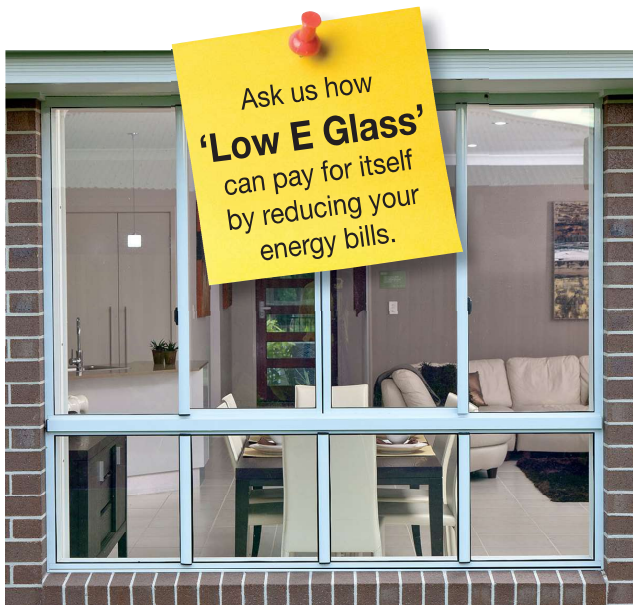
Windows to the world, Ask about how you can save on your energy bills.