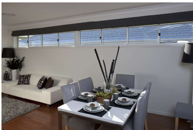
Windows that allow easy furniture location without compromising natural light